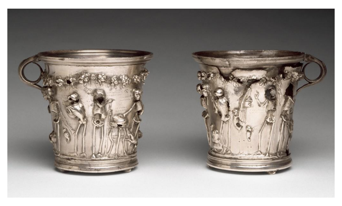
Fig.2— Two Roman, one-handled wine cups from the Boscoreale Treasure (Source: artstor.org).

We see this connection most directly with feast objects themselves: mosaic floors from dining rooms, like the larva with two serving jugs (Fig.1), or the reclining larva (presumably dining) with the words " \Gamma N\Omega\Theta I \Sigma AYTON " written above (Cruz, 2022, Lecture 0.1). Two unique silver cups from the "Boscoreale Treasure"(Fig.2) feature larvae imagery and date to circa 1st c. CE (Weber, 1922, p.35). These cups have inscriptions of varying seriousness, from "Enjoy yourself while you are alive" to "be reverent to dung" (Weber, 1922, p.37).